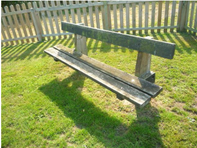
Timber Picnic Bench